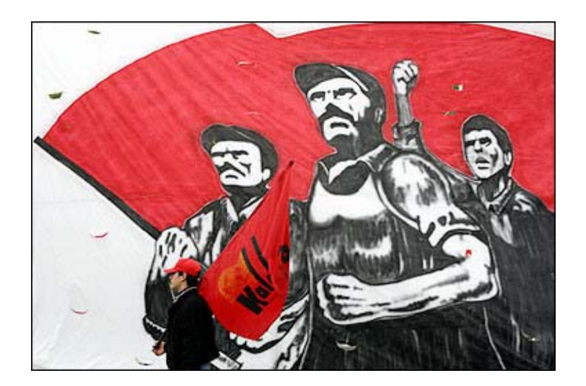
On the march : A protestor walks in front of a poster during a May Day demonstration in Kadikoy district in Istanbul.